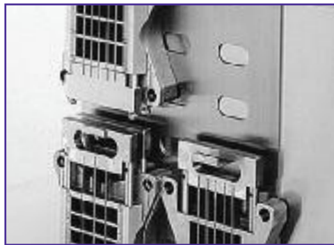
*Optional Grids Available